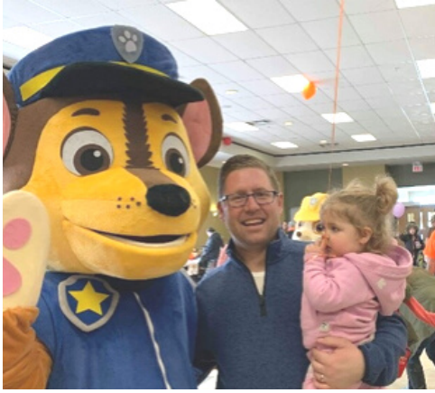
John Nater, MP for Perth-Wellington enjoying the festivities at LMHF's 1st Annual Family Fun Day

It was a year of firsts for the Louise Marshall Hospital Foundation (LMHF)