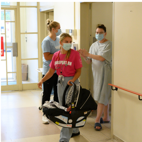
First patients to leave the old Groves heading to the new site