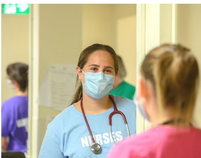
Staff work together to safely transfer patients