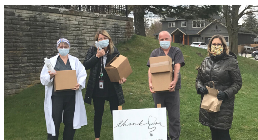
Elora Distillery donates hand sanitizer made at their newly-opened facility

Since the COVID-19 worldwide pandemic was declared, we have been blown away by the generosity of local businesses, groups, schools, and individuals. Thank you for the many donations of Personal Protective Equipment (PPE) and other essential supplies, and to the businesses who have offered discounts for our staff. To date, we have received over 54,000 towards the Groves’ COVID-19 Relief Fund, thousands of PPE, and dozens of gift cards for local restaurants.