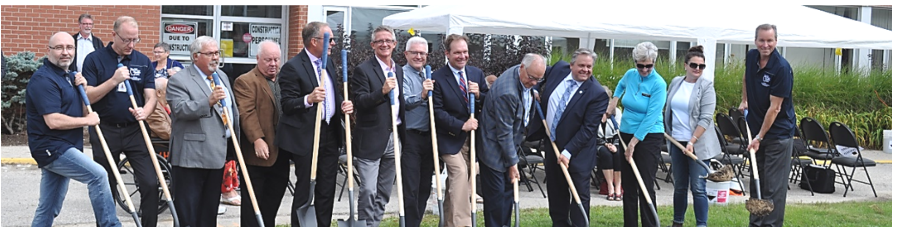
Community members, staff, foundation, volunteers and dignitaries break ground for the LMH expansion