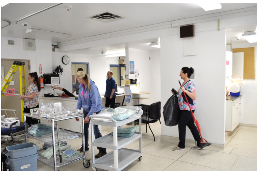
Staff busy helping to move out old LMH ER