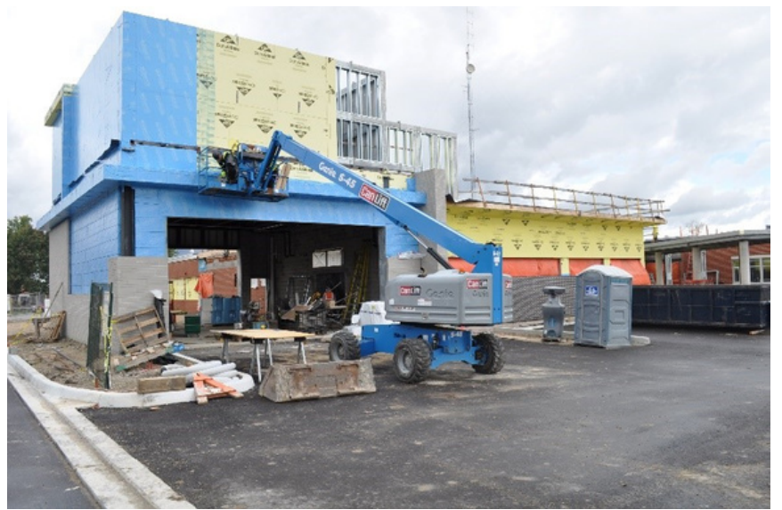
ER and Ambulance Bay Expansion

We are looking forward to Spring of 2021!