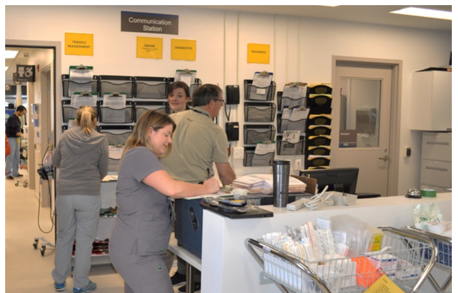
Staff busy helping to move into new temporary ER