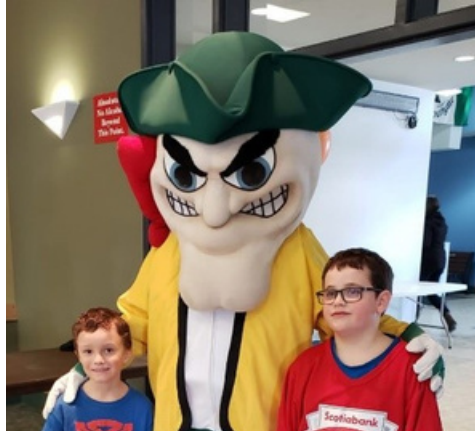
Guelph Patriots mascot and friends stopping for a quick photo before hitting the ice