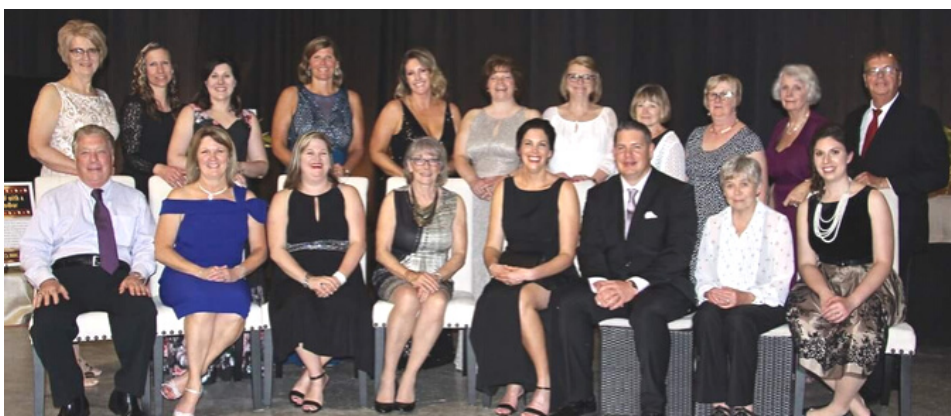
Gala Leadership Team