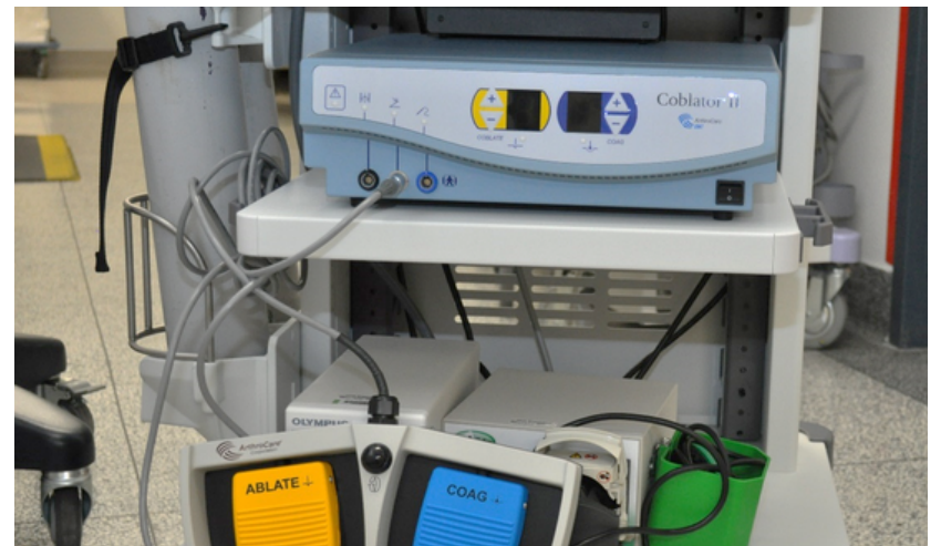
New coblation equipment for use in general surgery procedures