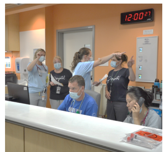
First shift at new Groves Emergency Department