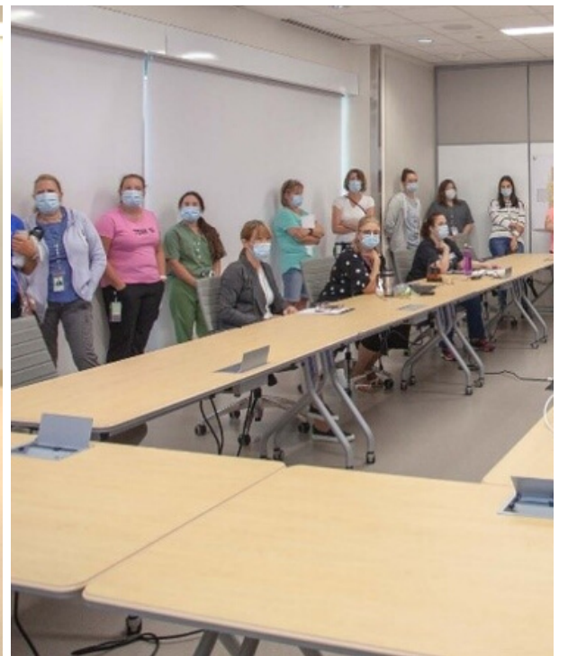
Staff huddles at both legacy and new hospital to prepare for move day