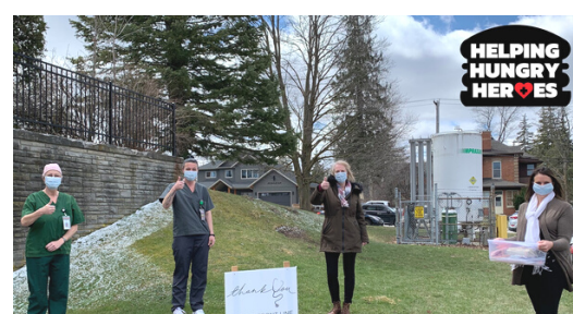
Grand River Agricultural Society & Raceway donate $10,000 in gift cards for Helping Hungry Heroes Campaign