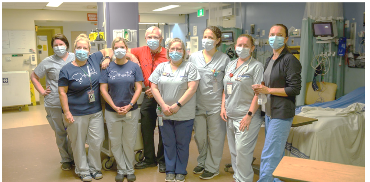
Last shift at legacy Groves Emergency Department