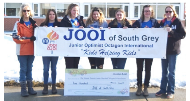
The Louise Marshall Hospital Foundation received a $500 donation from the Junior Optimist Octagon International (JOOI) of South Grey.