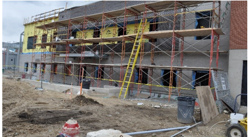
Ambulatory Care- two-storey expansion