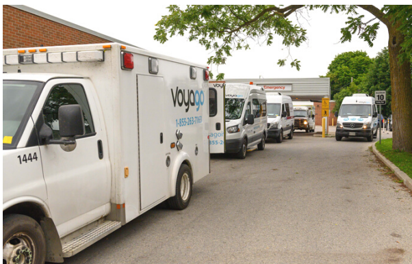
Patient transfer vehicles line up to take patients to the new hospital