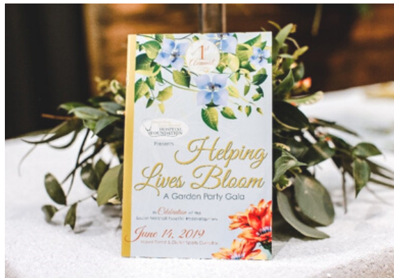
Gala Table Décor