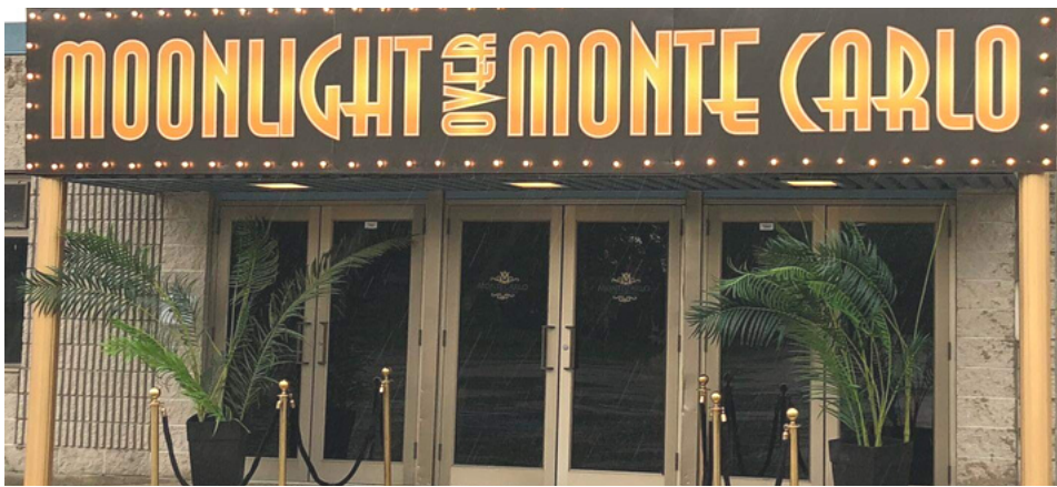
Entrance to the 19th Annual Starlight Gala event

Helping to achieve excellent patient-centred care