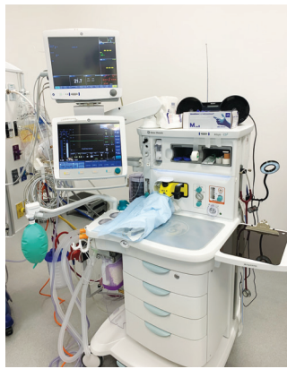
Anaesthetic Monitor & Machine, funded by donors.