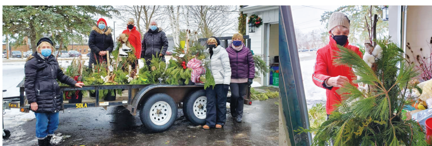
Palmerston and District Hospital Volunteer Auxiliary members prepare for a greenery sale in support of the hospital.]

COVID-19 has impacted the Palmerston and District Hospital volunteer activities this past year. The good news is volunteer services will be reintroduced back into hospital programs soon. In December volunteers were able to hold a Greenery Sale during the Kris Kringle shopping night and at other locations throughout Palmerston. All proceeds support the hospital. The Auxiliary is always looking for new members to help support fundraising efforts and programs. Please visit www.nwhealthcare.ca to find out more information.