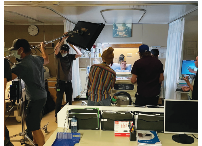
Filming a Mothers Against Drunk Driving Commercial