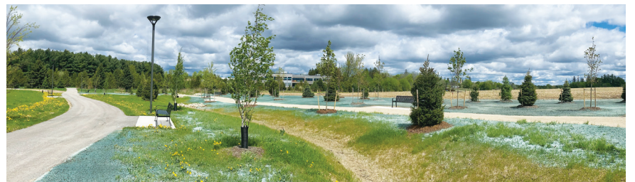
Trees are now planted in the Memorial Forest (May 2022)