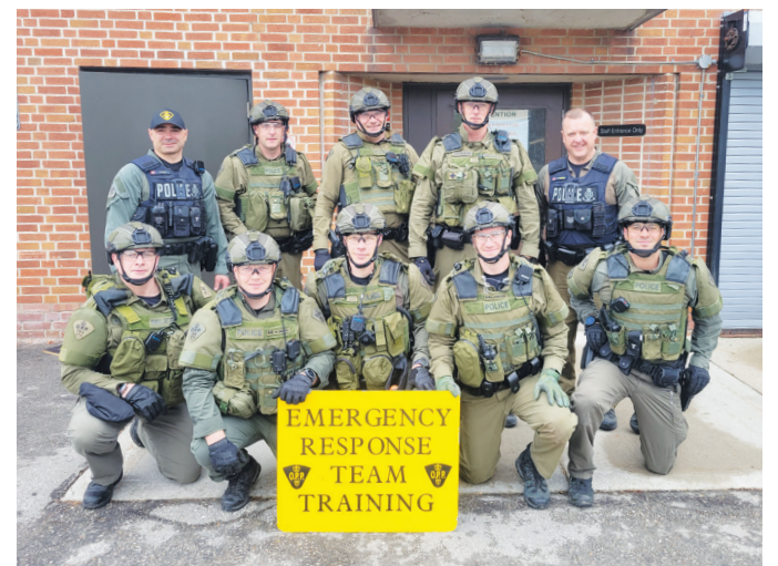
OPP Emergency Response Team