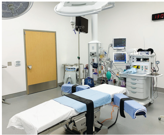
Operating Room Table, funded by donors.

Thank you for continuing to invest in your local hospital. Our work would not be possible without you and, together, the impact you create is truly extraordinary.