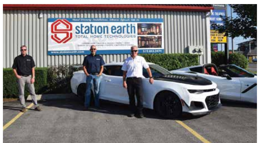
The team at Station Earth at their annual Hot Laps event.

We say this often, but that's because it's true! Our community has been incredibly generous and supportive this past year, despite the pandemic. We have received many donations from corporations, such as $12,000 raised from Station Earth's annual Hot Laps event for the Oncology Department, and RBC Foundation's $10,000 donation towards the CleanSlate UV. These contributions, along with the many others, enables us to provide safe, world-class health care to our patients and community. It truly means so much to everyone at Groves Hospital Foundation to have generous businesses and corporations by our side to help us achieve our fundraising goals.