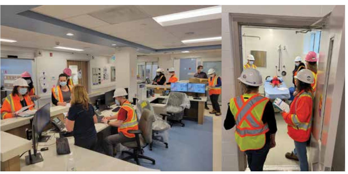
\label{lem:life} \mbox{LMH staff practicing day-in-the-life scenarios in the new emergency department.}

Picture moving into a new home and the usual logistical questions you ask yourself - Will the bed fit up the stairs? Where is the light switch for the basement? Where is the best place for the coffee maker? These are the same types of questions our staff will ask themselves when moving into the new LMH space. To ensure staff are not having to "look for the light switch" on opening day, they have been practicing "Day in the Life" scenarios to familiarize themselves with their new space. Running mock patient scenarios allows staff to figure out where equipment should be located, the best and fastest routes to take through the department and to discover any issues that may have been missed during the construction and planning.