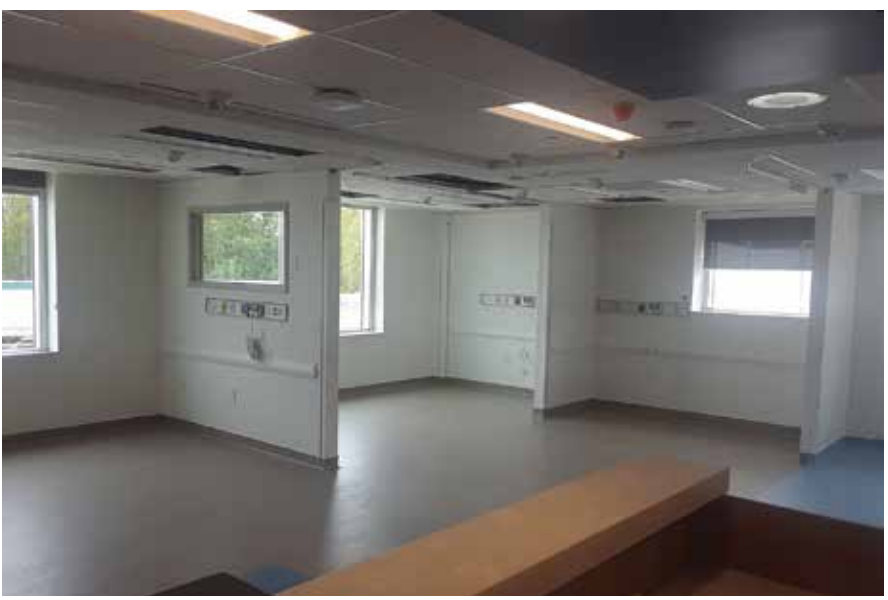
New bright oncology space where patients will receive their chemotherapy treatments.