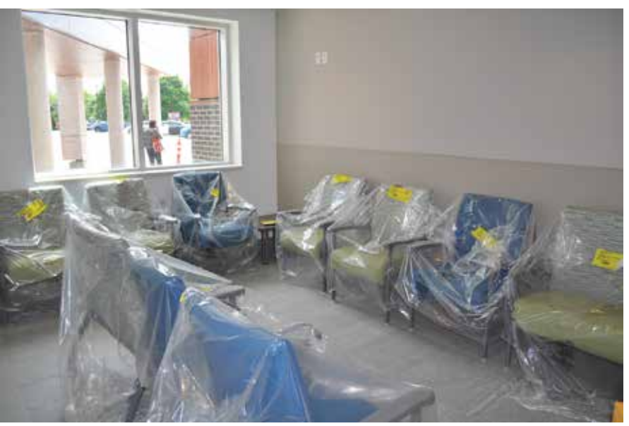
New emergency room waiting area - furniture has arrived