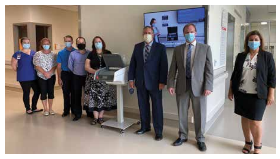
RBC Foundation donates funds to purchase a CleanSlate UV.