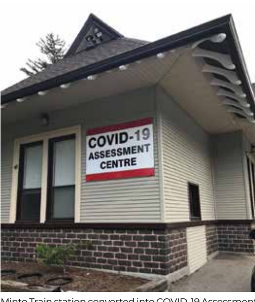
Minto Train station converted into COVID-19 Assessment Centre in Harriston.

GMCH and NWHC worked with a network of partners over the past year to help slow the spread of COVID-19 in our communities and protect our most vulnerable. Centre Wellington, Minto and Wellington North municipalities were all quick to respond and support the needs of our COVID-19 Assessment Centres and Caressant Care Arthur (CCA) Long-term Care Home. When vaccine supplies were limited, Wellington-Dufferin-Guelph Public Health provided support to help vaccinate CCA staff and patients. Upper Grand, Mount Forest and Minto-Mapleton Family Health Team partners were instrumental in providing staff to help with the COVID-19 Assessment Centre operations. We are grateful to all our partners for helping to navigate these challenging times and ensuring the best possible care and service for the people of our communities.