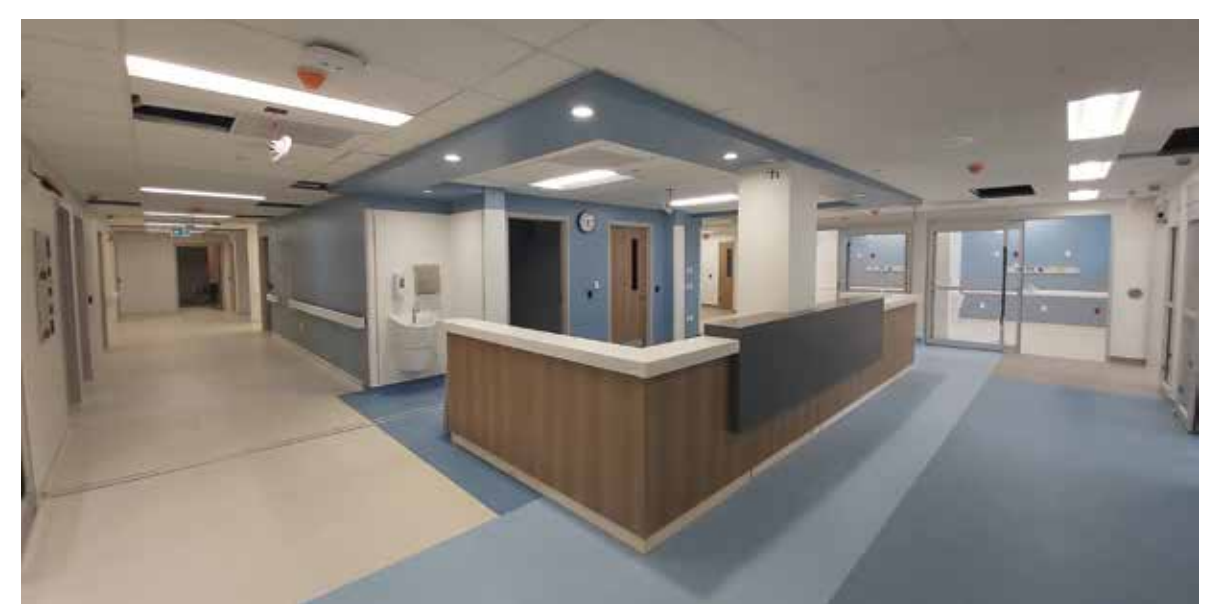
New emergency department.

Operating a hospital while it's under construction is no easy task. Louise Marshall Hospital (LMH) staff and physicians have worked hard over the past year to minimize the patient impact of the (at-times) noisy and disruptive construction work. It will all be worth it, as the new emergency and ambulatory care space, when open, will increase the overall size of the hospital from 45,000 to 57,000 sq.ft. The new space includes a secondstory addition that will house oncology, ambulatory care and day surgery. Set to open in phases, the new emergency department should be ready by mid-July 2021 and the ambulatory care space will open soon after.