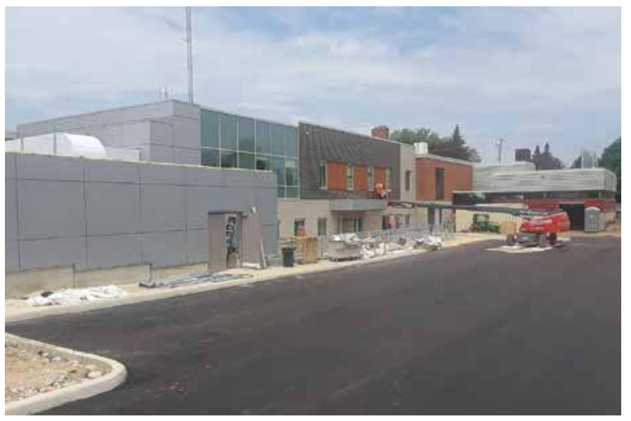
New two-storey addition housing ambulatory care department, day surgery, boardroom and offices.