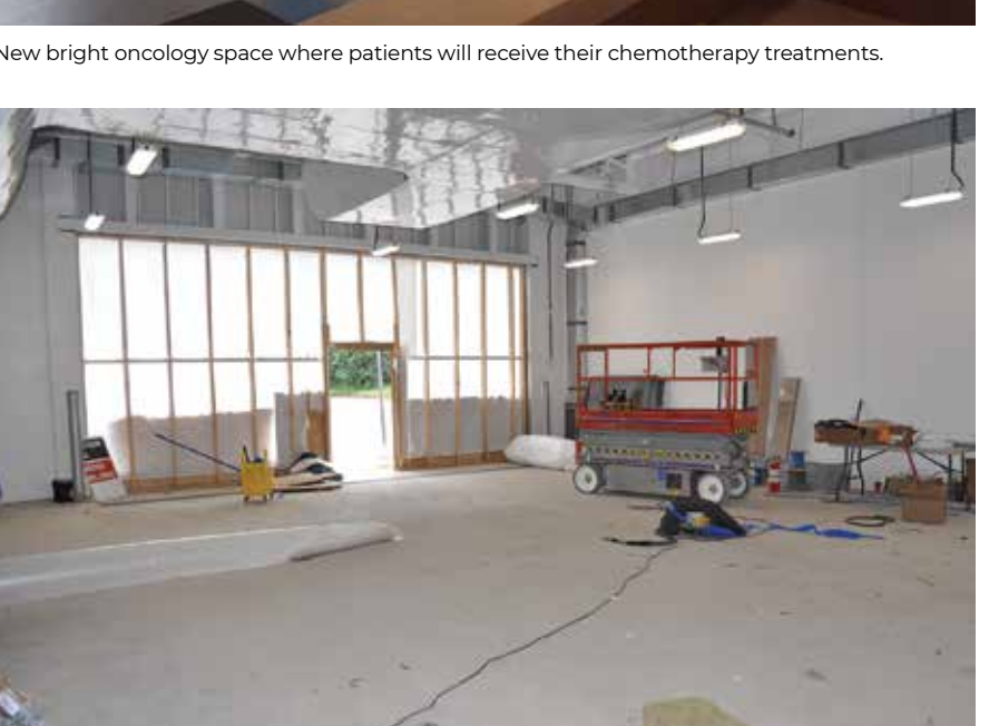
New covered ambulance garage that accommodates two vehicles.