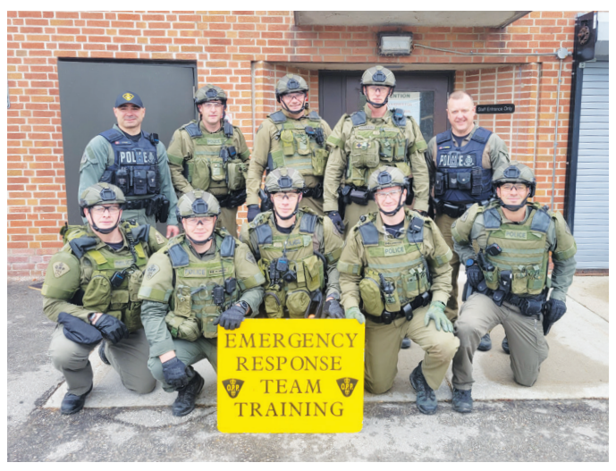
OPP Emergency Response Team