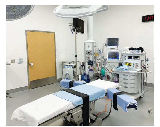
Operating Room Table, funded by donors.

Thank you for continuing to invest in your local hospital. Our work would not be possible without you and, together, the impact you create is truly extraordinary.