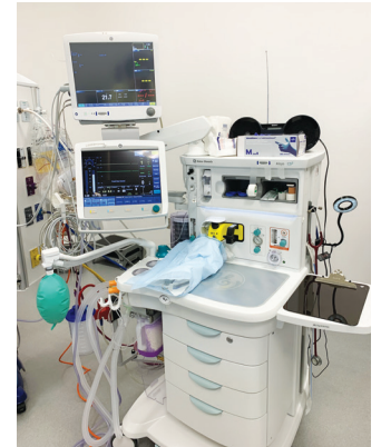
Anaesthetic Monitor & Machine, funded by donors.