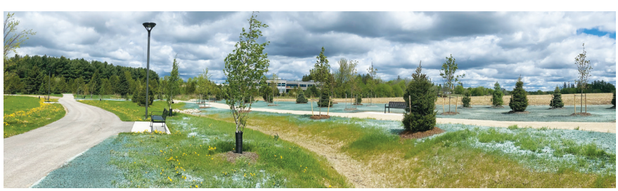
Trees are now planted in the Memorial Forest (May 2022)