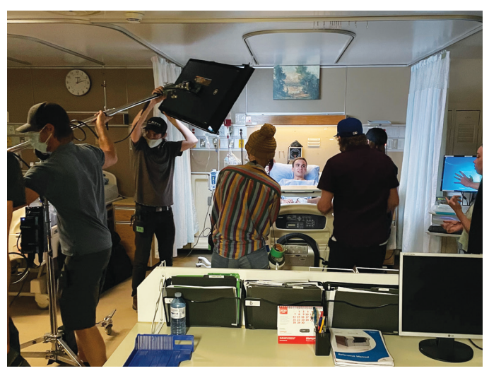
Filming a Mothers Against Drunk Driving Commercial